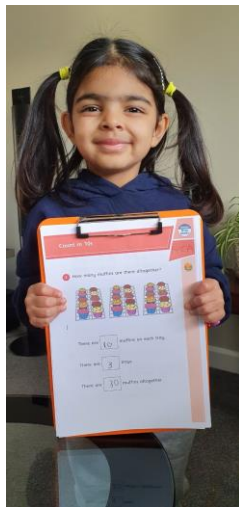
Analea (Cedars) has been doing some baking. They look delicious. Well done.