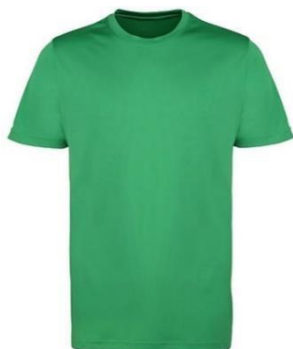
PE top and shorts