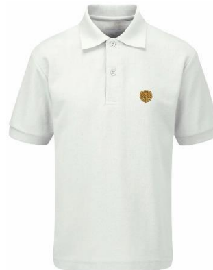
White polo shirt with school logo