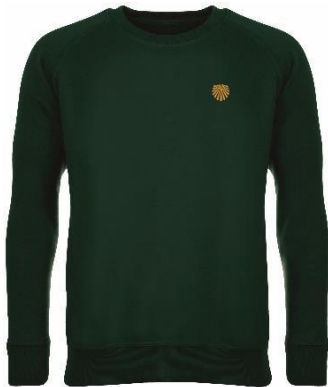
Bottle green sweatshirts with school logo