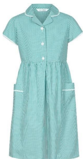
Plus Fit Classic Summer Gingham Checked Dress Item No T766449P

These dresses are available from your local Marks and Spencer.