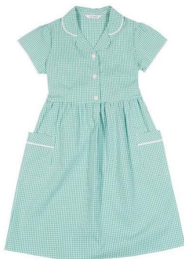
Classic Summer Gingham Checked Dress Item No T766461