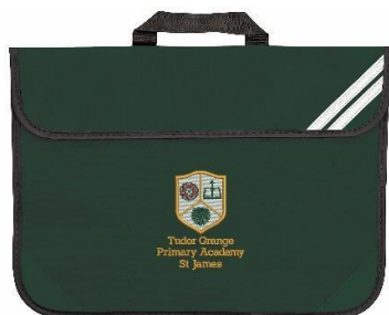
School Book Bag

NB - Trainers or sandals are not allowed