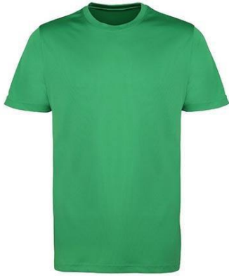
Academy sports top