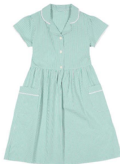
Skin Kind Pure Cotton Summer Gingham Checked Dress Item No T76648S

Boys are able to wear white, short sleeve shirts and grey school shorts.