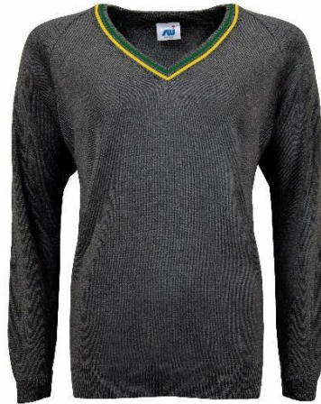
Academy V-neck with double stripe