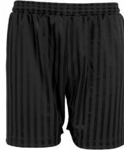
Academy shadow stripe shorts Black